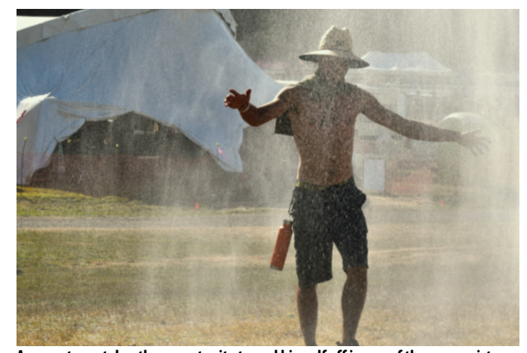
A concertgoer takes the opportunity to cool himself off in one of the many mist showers found on the festival grounds.