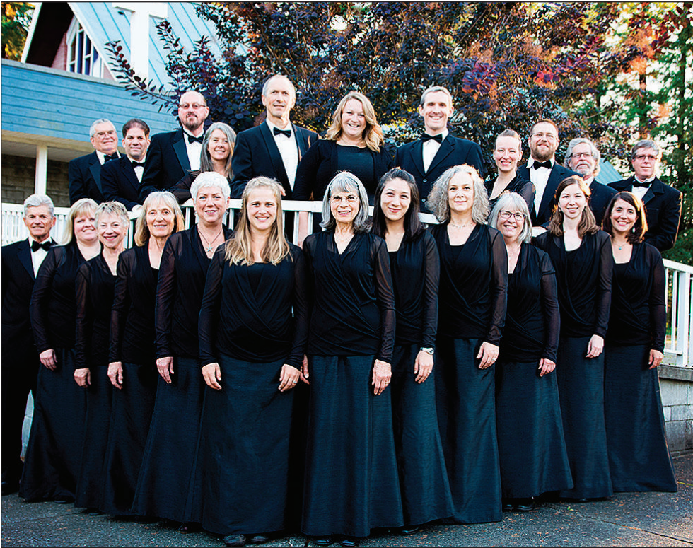
The Island Voices Chamber Choir.